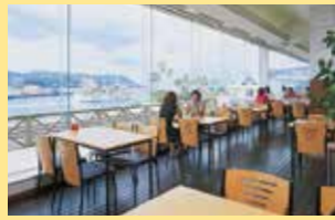
Restaurant Dolphin Kitchen (2nd fl.) Enjoy your meal with a waterfront view.