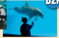
Marine Space of Encounters