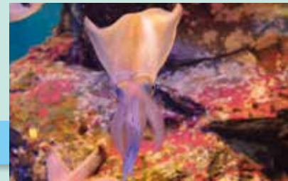
Bigfin reef squid

When you pass through the Lava Tunnel, you will see the marine creatures in Kinko Bay and the sea world of Kagoshima north of Yakushima and Tanegashima.