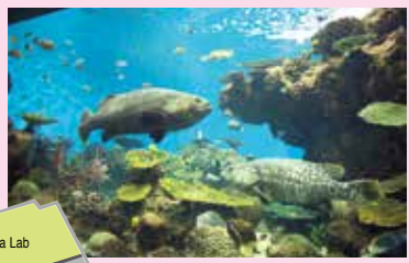
Coral Reef Tank