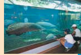
Pirarucu, the world's largest freshwater fish, is on display.